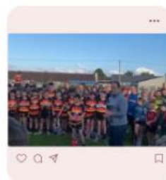
U12 Div 1 Final Most Viewed Live