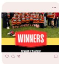
Senior Camogie Final Most Viewed Post